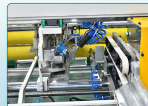
配备外置独立冷胶系统和热熔胶喷胶系统，自动喷胶 Equipped with external independent cold glue system and hot melt applicator, automatic glue spraying